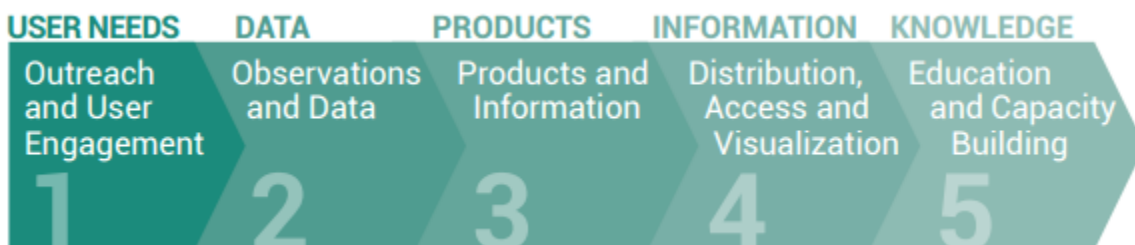
Figure 2: AquaWatch working groups. The five working groups work in a collaborative manner to achieve AquaWatch’s objectives.

The Working Groups are standing bodies of experts that will conduct the activities outlined below on an ongoing basis.