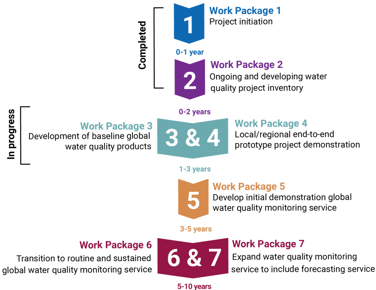
Figure 5: The work packages of the AquaWatch water quality information service project.

Implementation of the water quality information service is organized into seven work packages (Figure 5). In the future, additional work packages may be added. Work necessary to complete the work packages will be carried out by specialists from the working groups as outlined above.